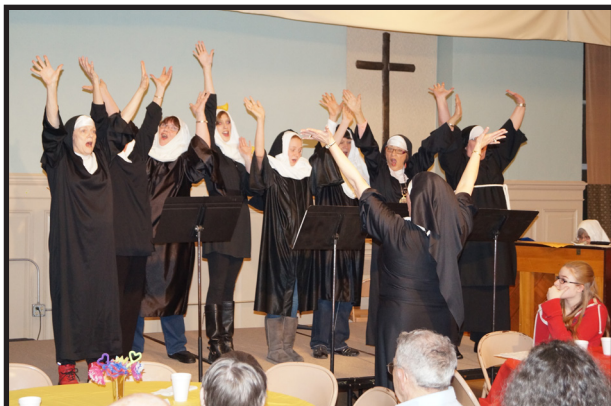
The sisters of First Baptist Church, filled with the Spirit at the 2014 talent show!