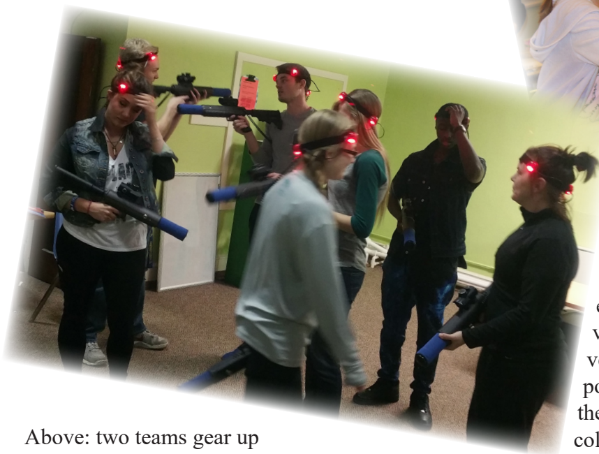
Above: two teams gear up and prepare for battle.