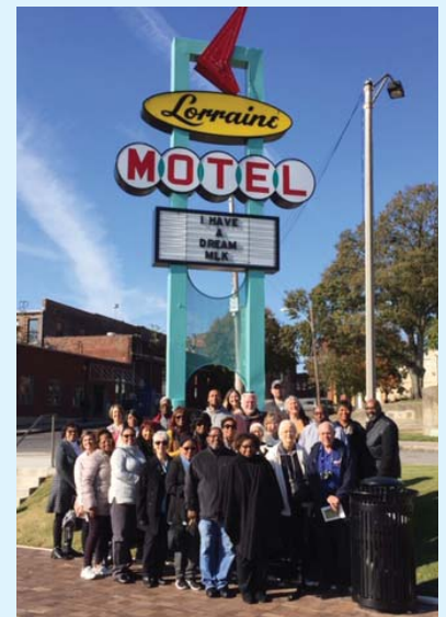
Our group at the Lorraine Motel