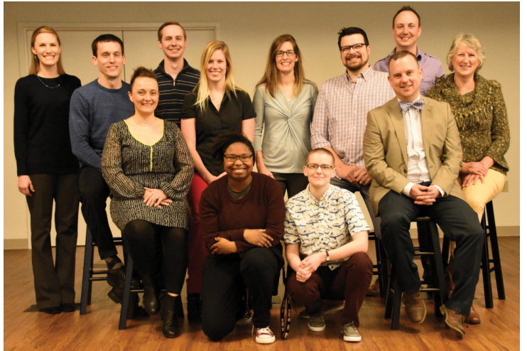
Awakening Praise Band 2018