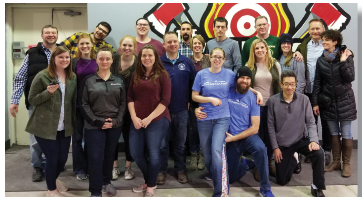
Parent's Night Out adults enjoyed throwing some axes