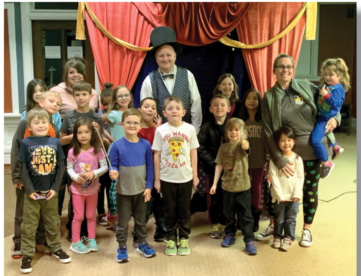
Parent's Night Out children enjoyed a real magic show