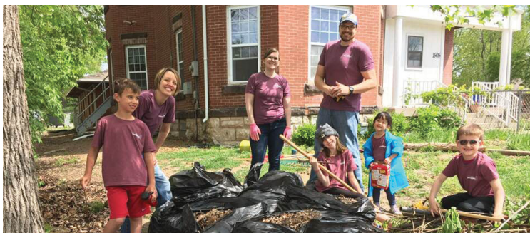
Yard Clean Up Crew at Mary Lee Johnston Community Learning Center