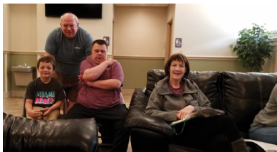
Volunteers at the FBC Prayer Hub