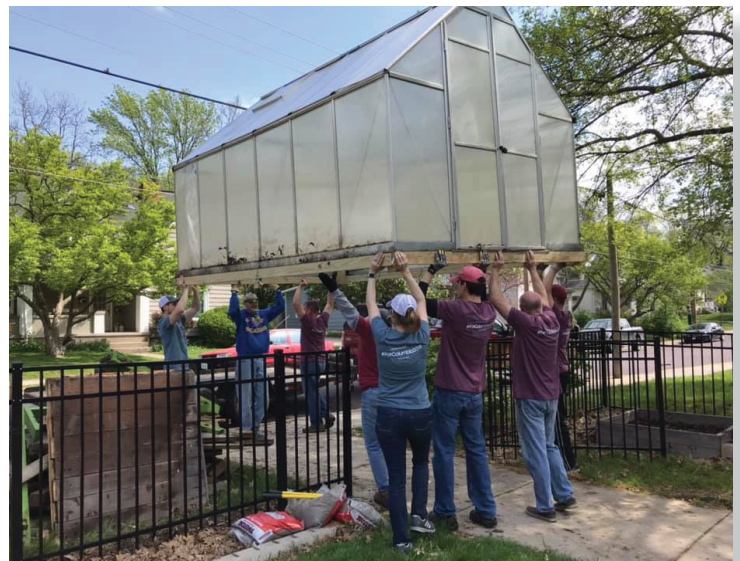
Volunteers repair and relocate greenhouse at Benton Elementary School