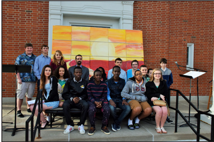
Youth Sunrise Service

Easter weekend at First Baptist was a beautiful celebration of the Risen Christ.