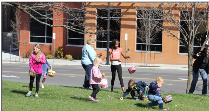
Enjoying the Easter Egg Hunt on April 4.