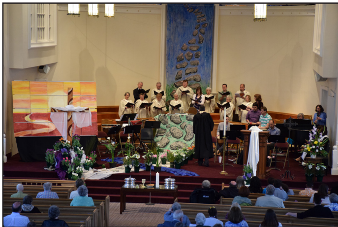
Celebrating the Risen Christ in Traditional Worship