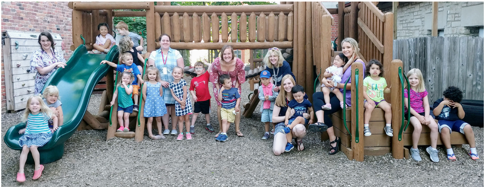
Summer session teachers and children enjoy the awesome playground.